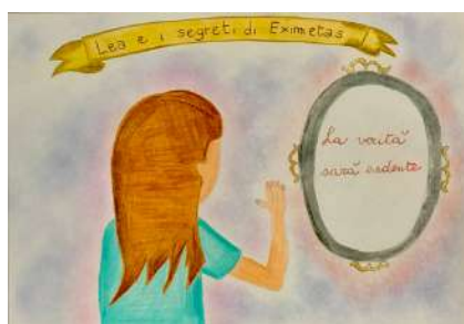
G2 - LEA E I SEGRETI DI EXIMIETAS

lottato al fianco di DRAGHI dorati contro personaggi ombrosi e malefici, coadiuvati nelle loro avventure fantasy da strani professori e infine, con CORAGGIO, LEALTÀ e AMICIZIA, hanno scoperto la bellezza e la gratificazione che si ottiene lottando insieme per un unico scopo: salvare la scuola e sé stessi dai cattivi!