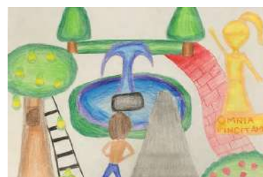
G5 OMNIA VINCIT AMOR