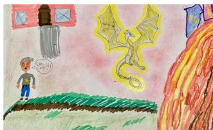
G3 - IL DRAGO DORATO

È stata un'avventura fantastica che ha fatto battere il cuore e dato uno sprint alla voglia di scrivere altre avventure avvincenti!